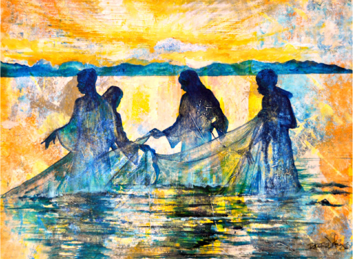
"Fisher of Men"

Rex DeLoney, Little Rock, AK mixed media, 2012