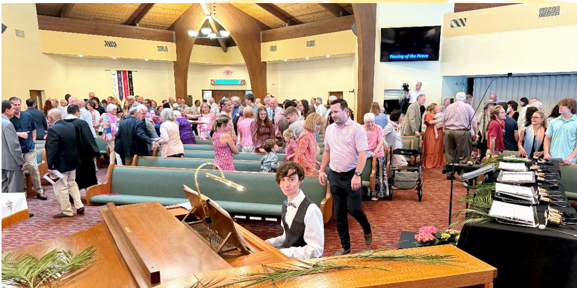
Passing the Peace