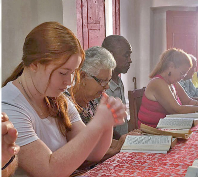
CUBA MISSION TRIP - Travel, Medical Supplies, and Prayers