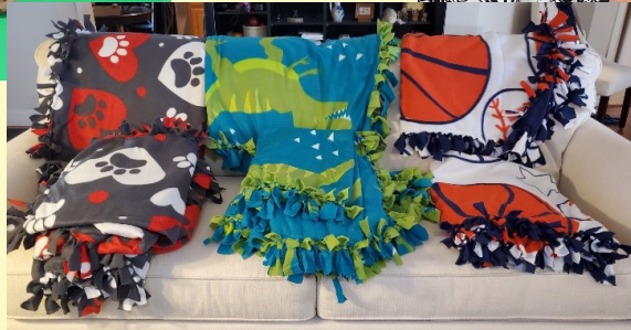
PW donated 10 blankets to Project Linus